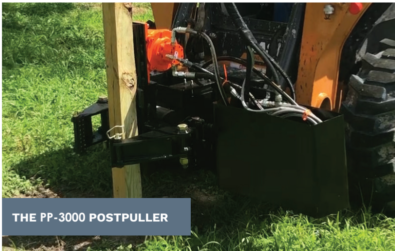
THE PP-3000 POSTPULLER

The "right tool for the job" comes down to efficiency. After the PP-3000 for guard rail post, Amkin applied the design to mini skid steer units for landscaping and fencing projects. The PP1800 makes quick work of the removal. For shrubs and trees the vibrating effect removes the dirt from root ball to eliminate waste. No more digging, no more straps.