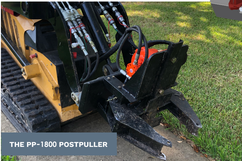
THE PP-1800 POSTPULLER