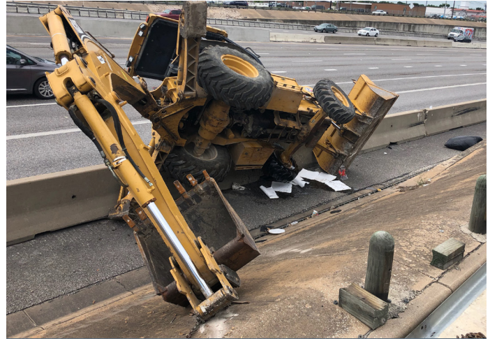
THE DANGERS OF CHAINS

Guard rail posts, fence posts, sign posts, whatever it may be, the POSTpuller can tackle the job.