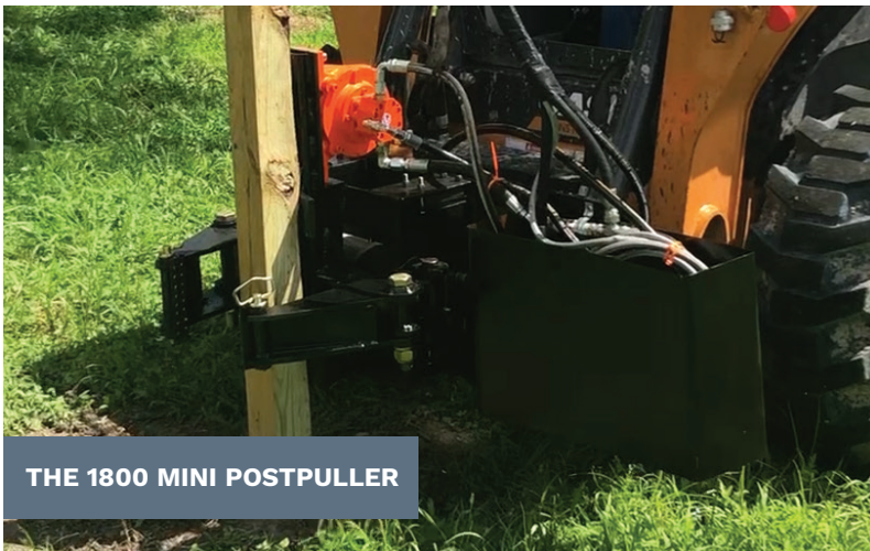
THE 1800 MINI POSTPULLER

There are countless stories of contractors, operators, and field technicians having to pull out post and ended up using a choker chain that broke on them. The amount of energy released in that breakage should cause on site supervisor, manager or client to take a serious look at the practice of using chains. One such incident at a state DOT launched the effort to eliminate such risks.