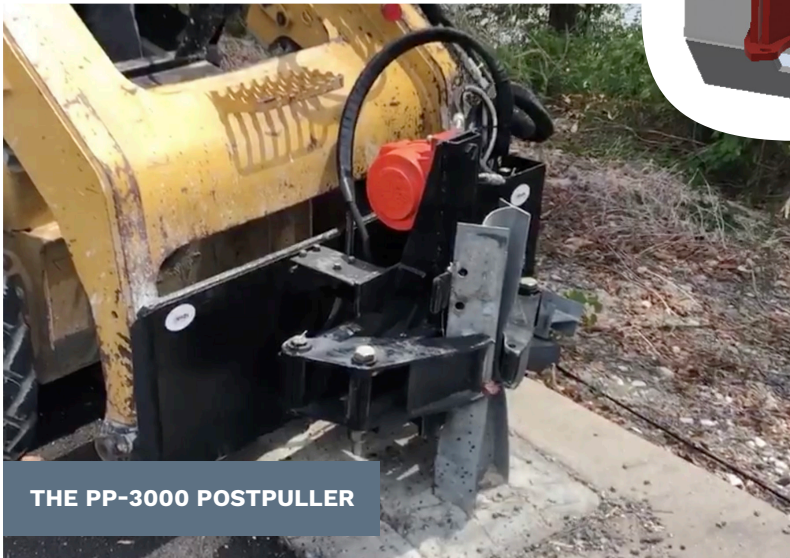
THE PP-3000 POSTPULLER